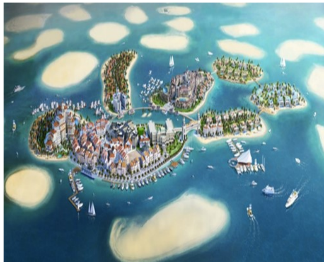
The World in Dubai