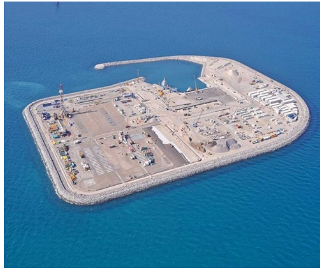
Upper Zakum Islands for Abu Dhabi National Oil Co (ADNOC)