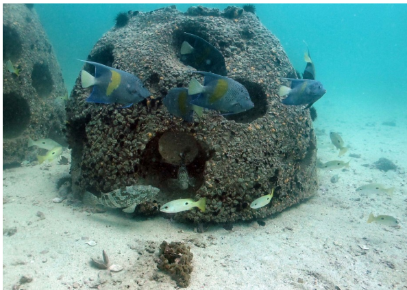
Concrete reef balls in Ras Al Khaimah

We contributed with sister company RAK-NOR to the preservation of marine life with the supply of rock for making concrete reef balls in Ras Al Khaimah and also for high-performance concrete quay wall blocks for the new deep water berths at Saqr Port in Ras Al Khaimah