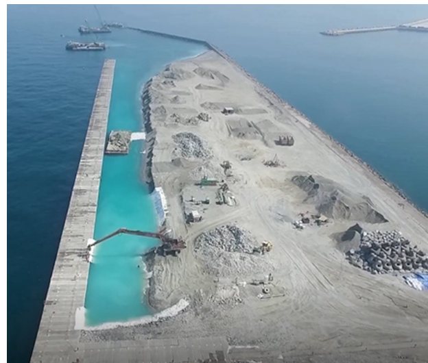
New deep-water berths at Saqr Port

Stevin Rock's customers' satisfaction is of paramount importance and the Company is committed to maintain the highest level for the quality of its products and services, recognized by the Company's ISO 9001 certification through the use of state-of-the-art equipment supervised by highly qualified and experienced management together with stringent quality assurance procedures.