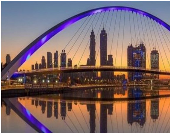
Dubai Water Canal