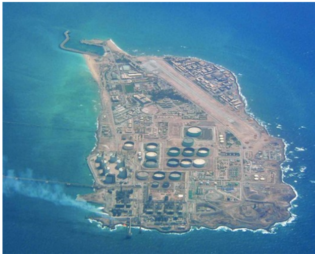
Das Island in Abu Dhabi