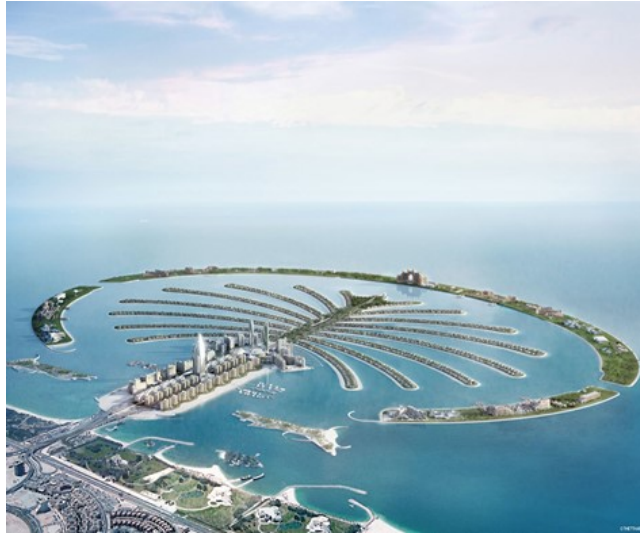
Palm Jumeirah in Dubai