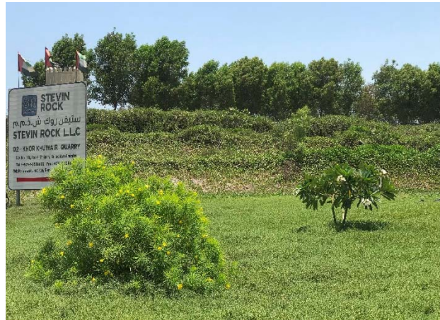
Go Green initiatives: planting of trees and grass