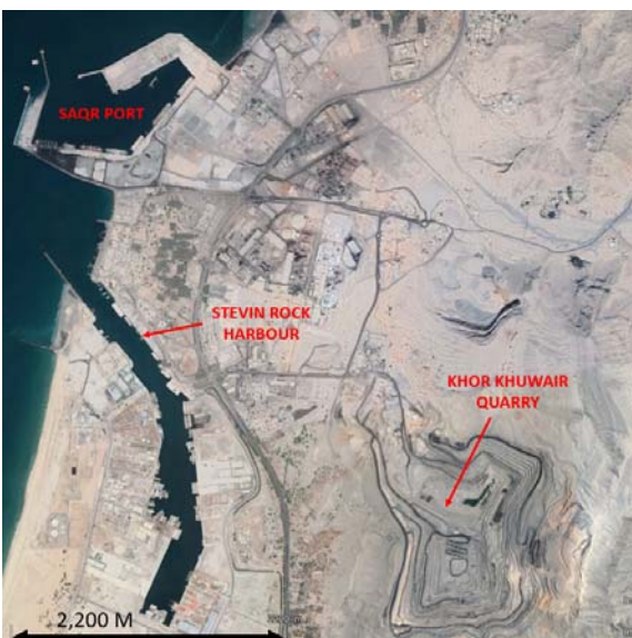
Location of Saqr Port, next to Khor Khuwair Quarry

Stevin Rock and its logistics partners have mastered handling and loading of the full range of stone products including armour rock up to 8 tonnes that can be shipped in specially designed 44,000 dwt bulk carriers.