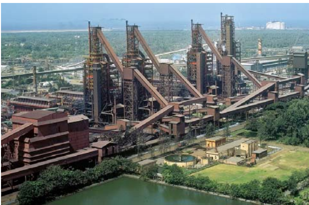
Essar Steel Mill in Gujarat, India