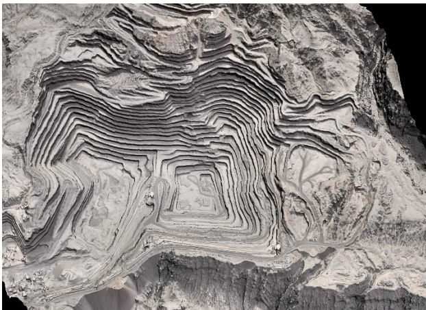
HR drone topographical survey of Khor Khuwair Quarry

The Company has been approved to International Management System Standards such as ISO 9001:2015 (Quality Management), ISO 14001:2015 (Environmental) and the recently acquired ISO 45001:2018 (Health and Safety); Stevin Rock has also complied with the requirements of the Framework Standard for Responsible Sourcing BES 6001: Issue 3.0.