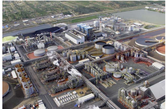
Ambatovy HPAL Ni-Co Plant in Toamasina, Madagascar