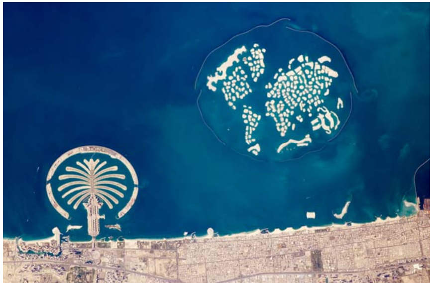
Palm Jumeirah and The World