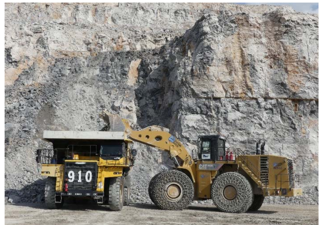
The largest loader in the region at work