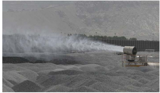
Water spraying aggregate prior to loading

Stevin Rock Harbour, next to Saqr Port, is also used for supplying crushed rock products to Dubai, Abu Dhabi and Gulf countries using barges up to 26,000 dwt.