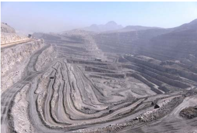
World class Khor Khuwair Quarry

Stevin Rock is one of the largest crushed rock producers in the world with a current capacity from three sites of over 80 million tonnes per year of limestone, dolomite and gabbro. The product range includes fine sand to coarse aggregate for asphalt, ready-mix plants, land reclamation, white beach sand, armour rock for sea defence/breakwater marine projects for the construction industry as well as feedstock for the cement, steel, chemical, glass and mining industries. The Company is wholly owned by the Government of Ras Al Khaimah, one of the seven Emirates of the United Arab Emirates, has over 3,500 employees and has operated and continuously grown for over 40 years. (See www.stevinrock.ae , www.linkedin.com/company/stevinrockllc , www.facebook.com/stevinrockllc )