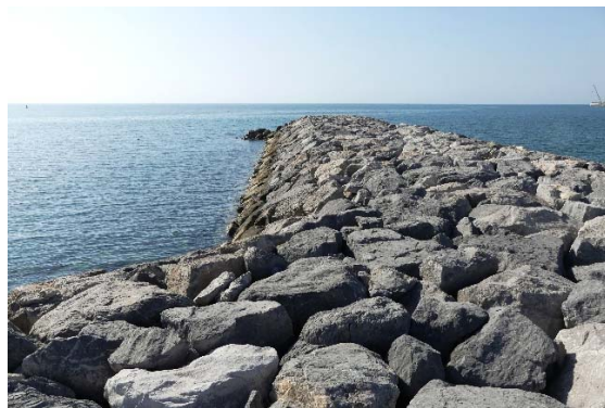
All sizes can be produced by Stevin Rock, from less than 5 mm fine aggregate to 8 tonnes armour rock